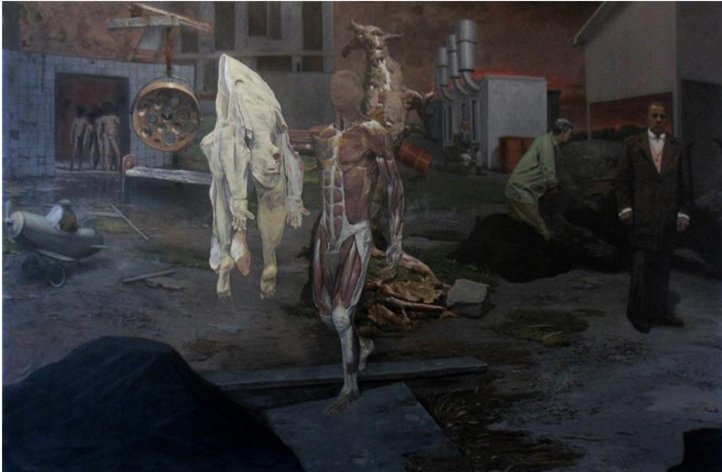
Option out of the table, 250 x 140, oil on canvas, 2012