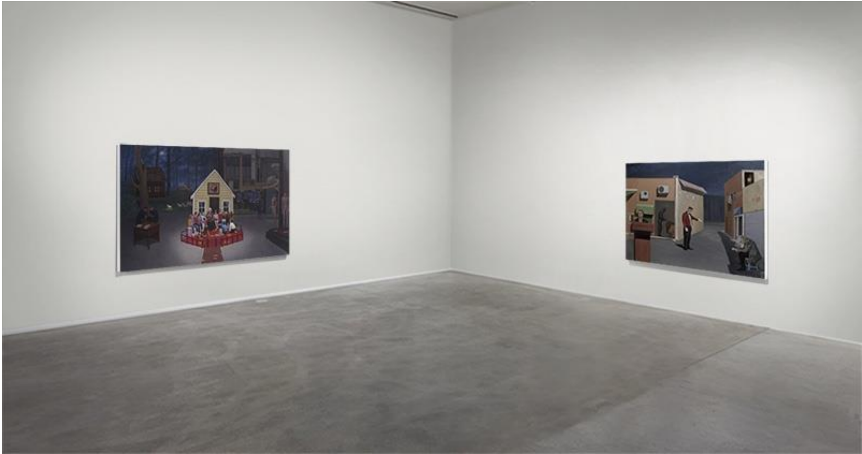
Installation view, Kunstwerk Carlshutte, Budelsdorf, Germany