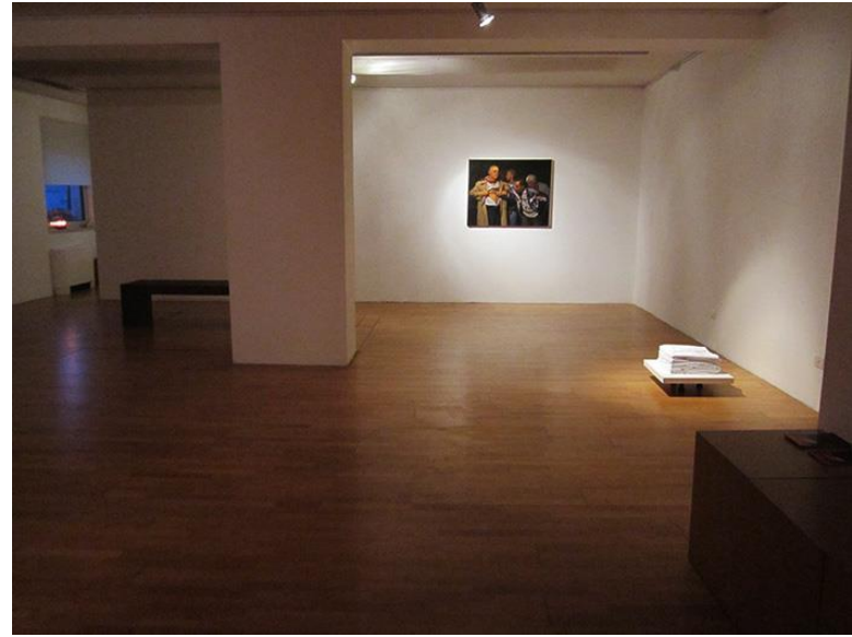
Installation view, Zeta Gallery, Tirana, Albania