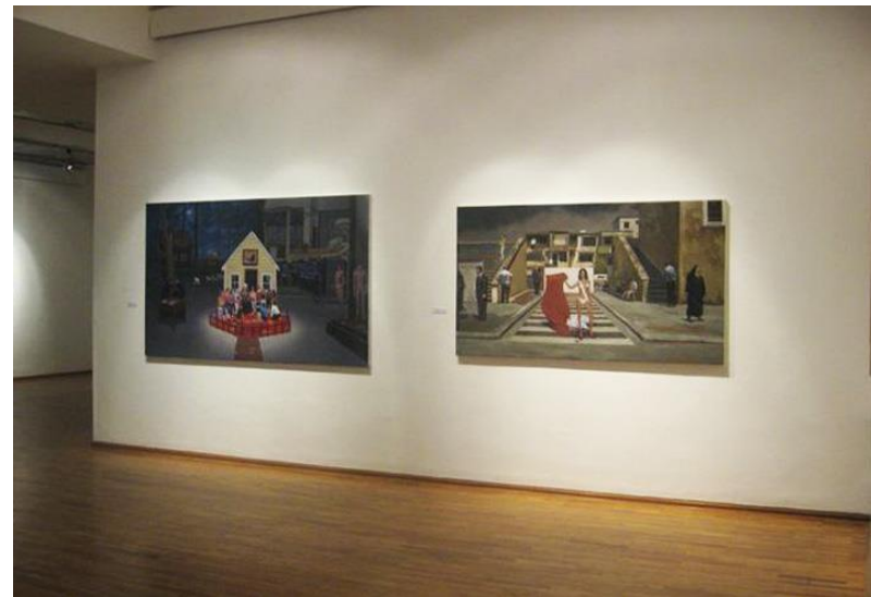
Installation view, National Gallery of Art, Tirana, Albania