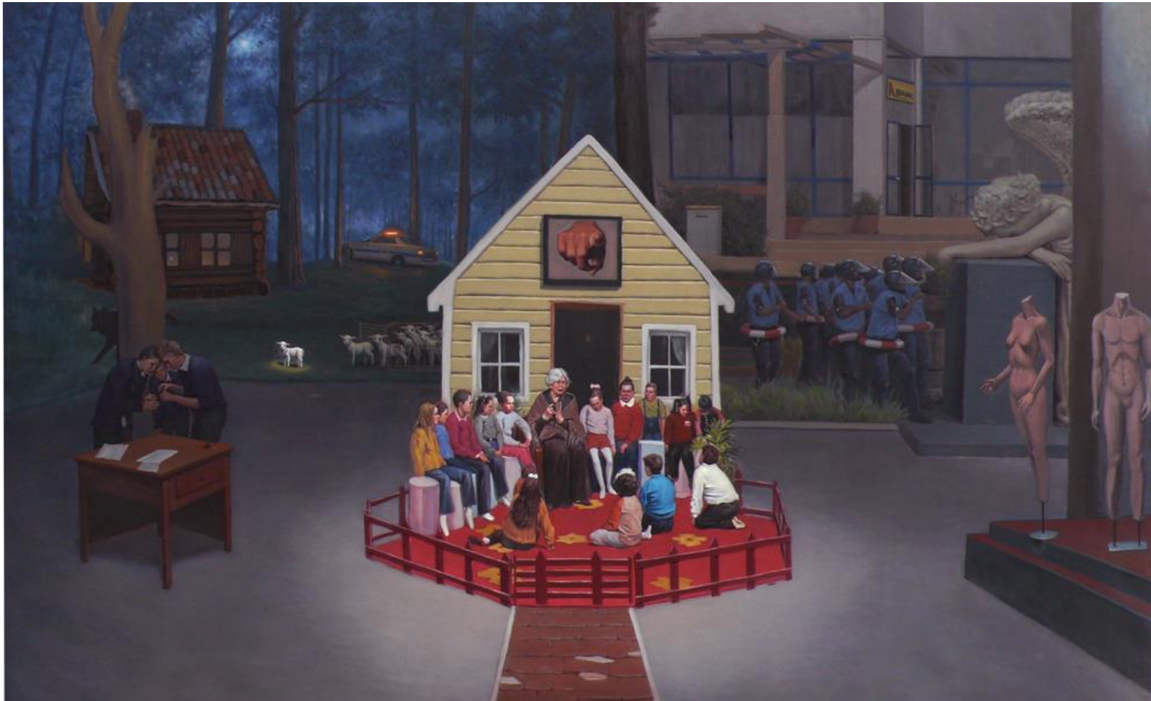
A fairytale from 1997, 240 x 140 cm, oil on canvas, 2009