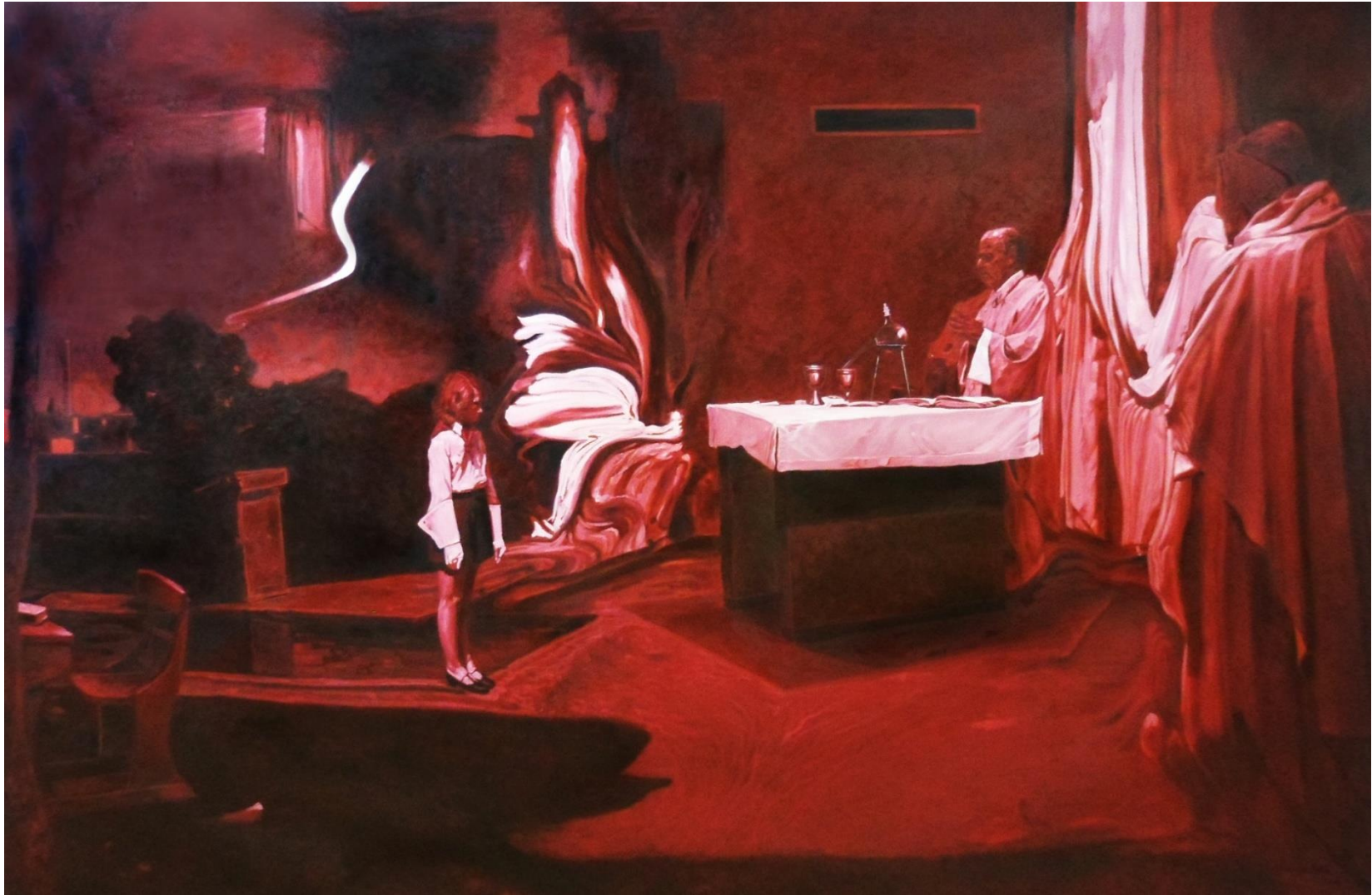
The alchemy, 2013, oil on canvas, 320 x 200 cm