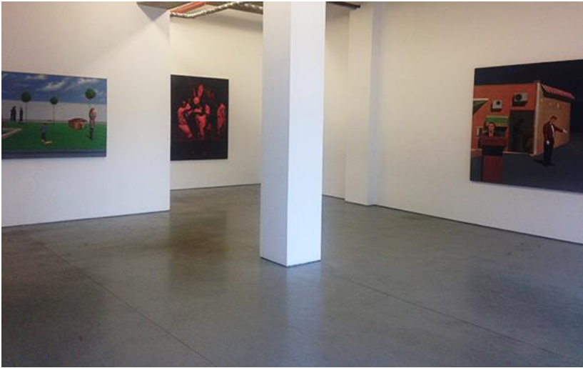
Installation view, Irrgang Gallery, Berlin, Germany