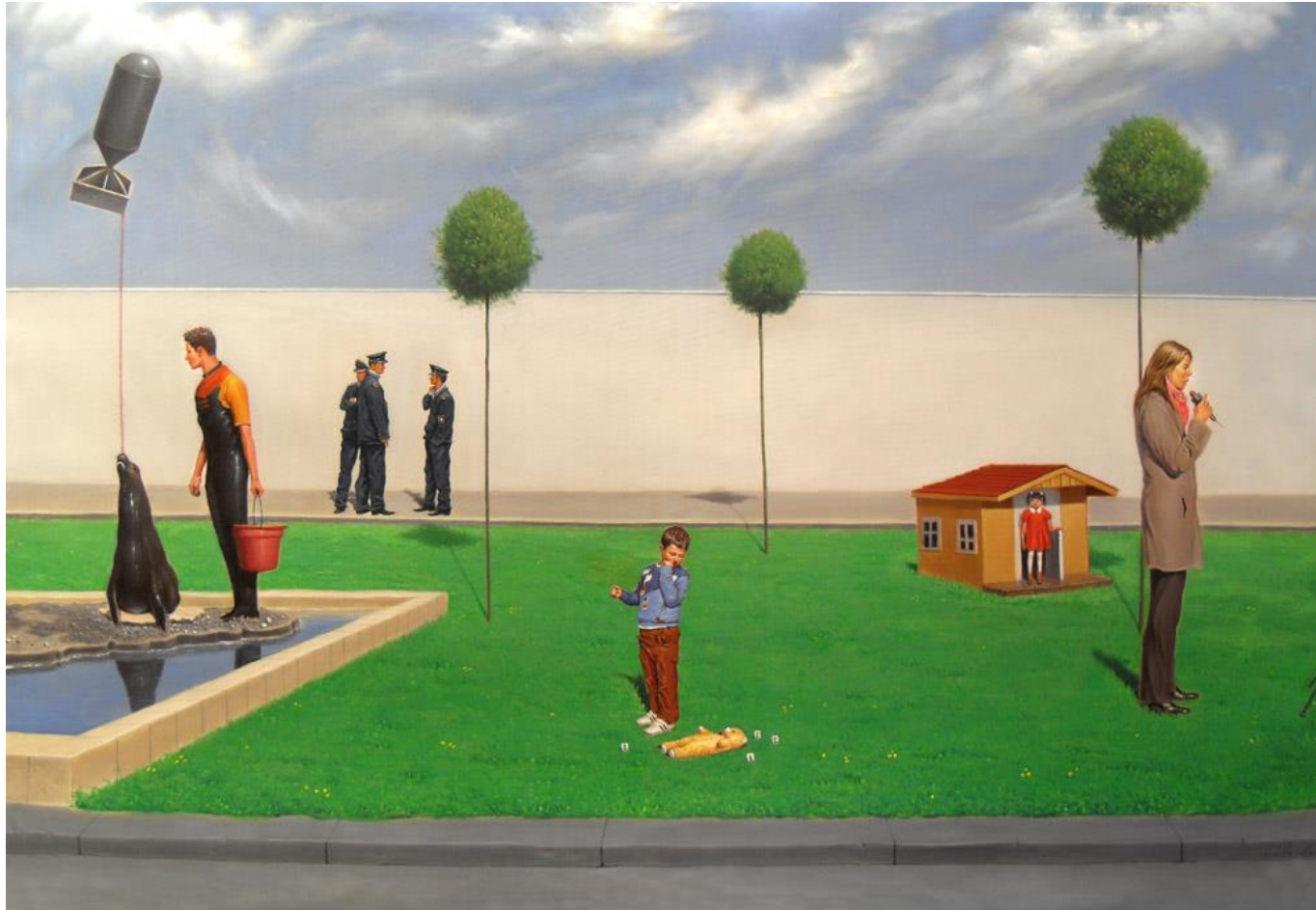
Breaking news, 2008, oil on canvas, 160 x 110 cm