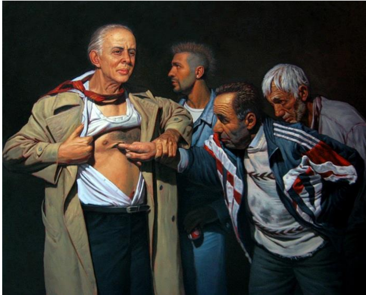
In your vein, 2010, oil on canvas, 100 x 90 cm