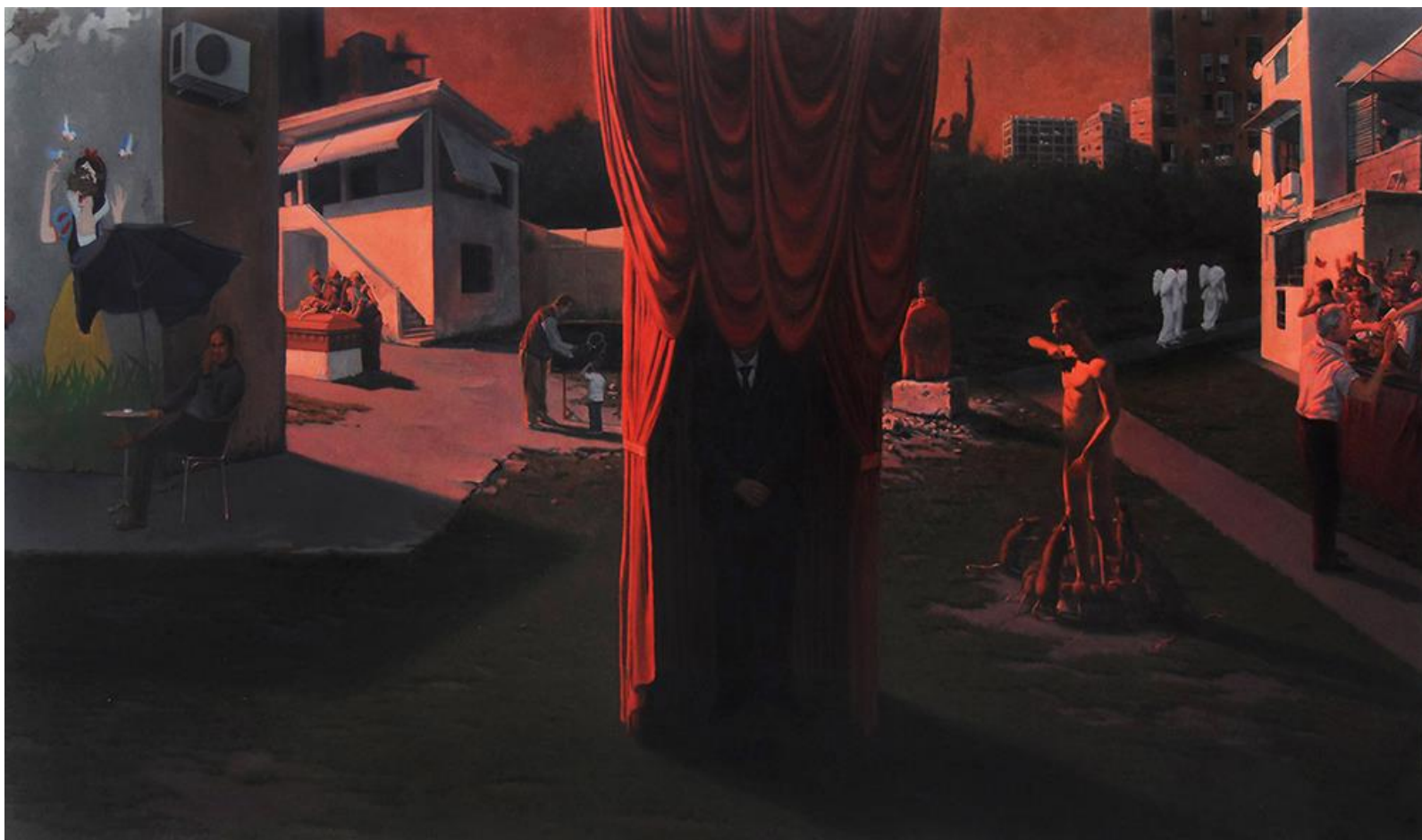
The Vertical Silhouette, 240 x 155 cm, oil on canvas, 2011