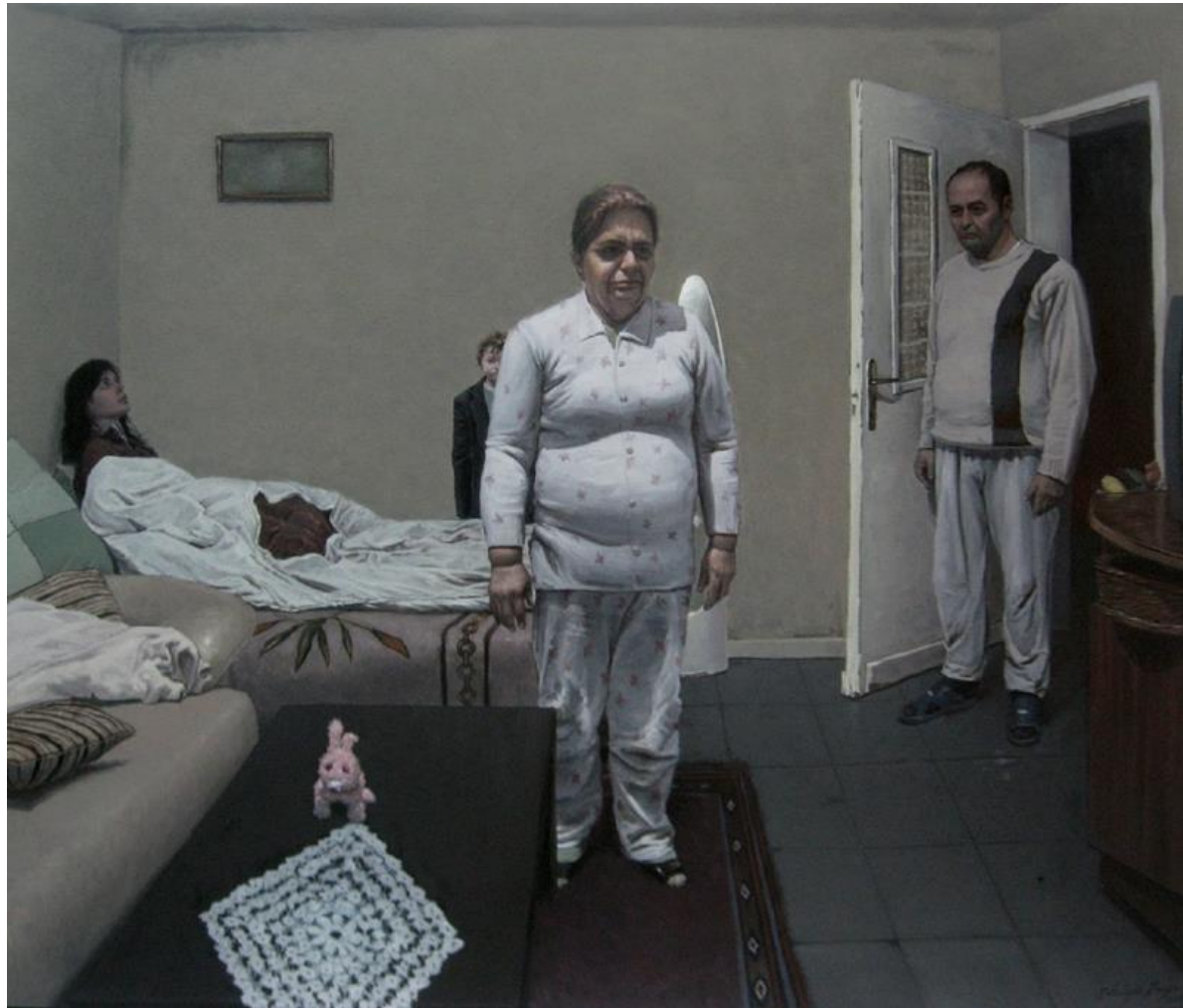
Still fog, 2011, oil on canvas, 120 x 100 cm