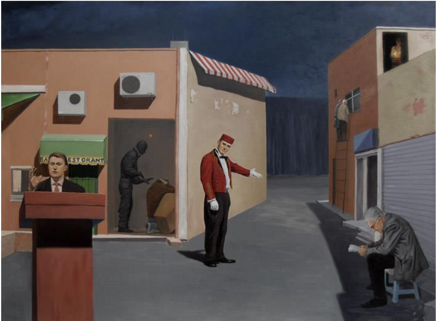
Ordinary meal, 2009, oil on canvas, 230 x 160 cm