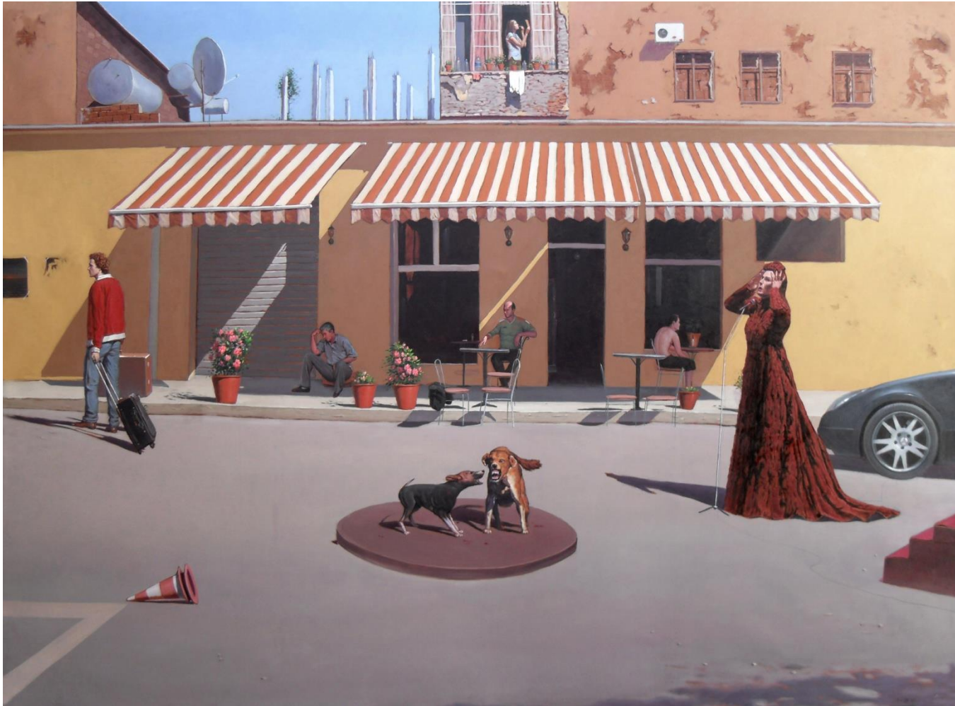
Strained hope, 2009, oil on canvas, 260 x 190 cm