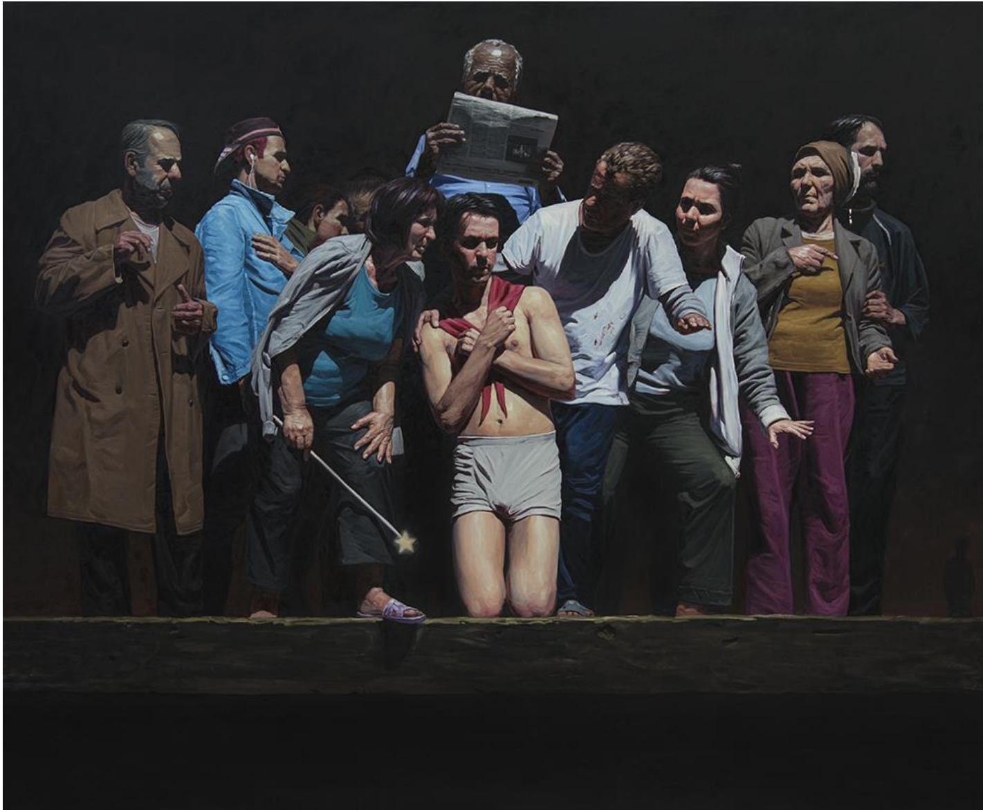
Visit in the Wound, 240 x 200 cm, oil on canvas, 2013