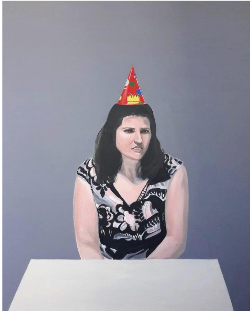
Celebration, 2018 Acrylic on Canvas, 103 cm x 122 cm