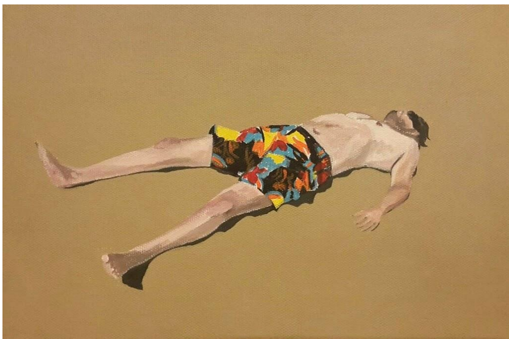
Playground, 2016 Acrylic on Canvas, 20 cm x 30 cm