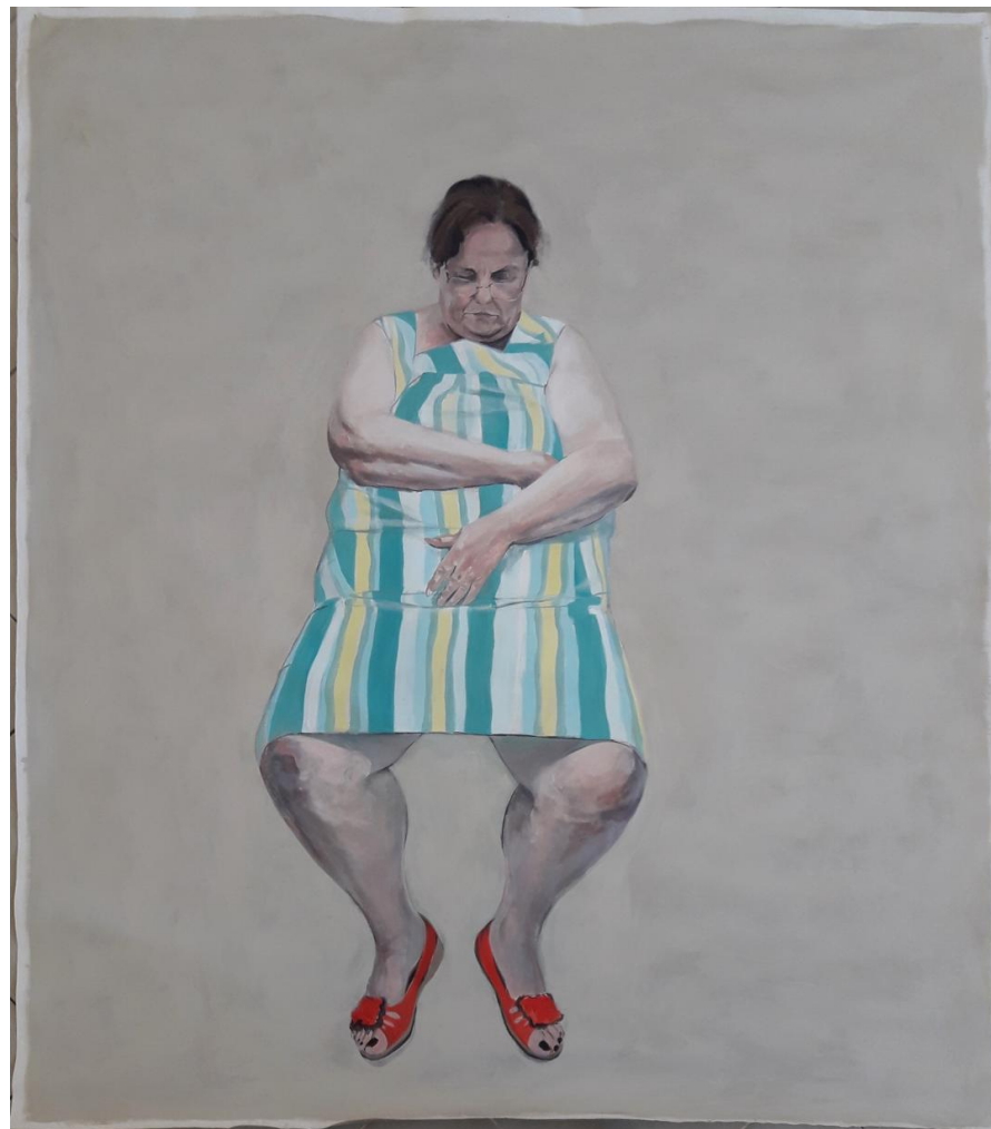
Mira, 2019 Acrylic on Canvas, 152 cm x 172 cm