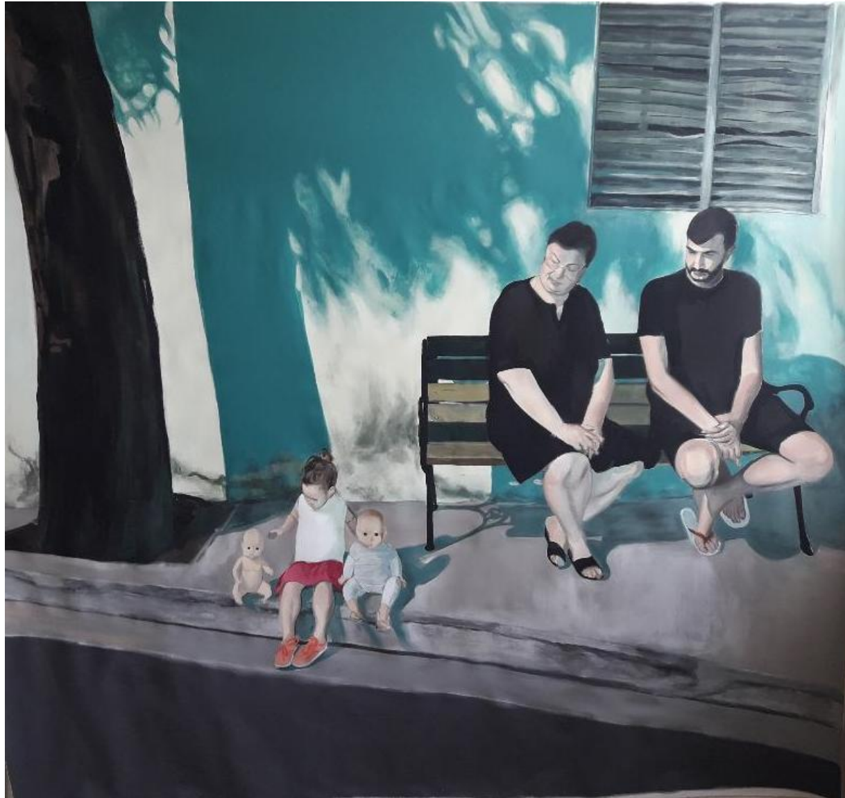
Playground, 2019 Acrylic on Canvas, 210 x 240 cm