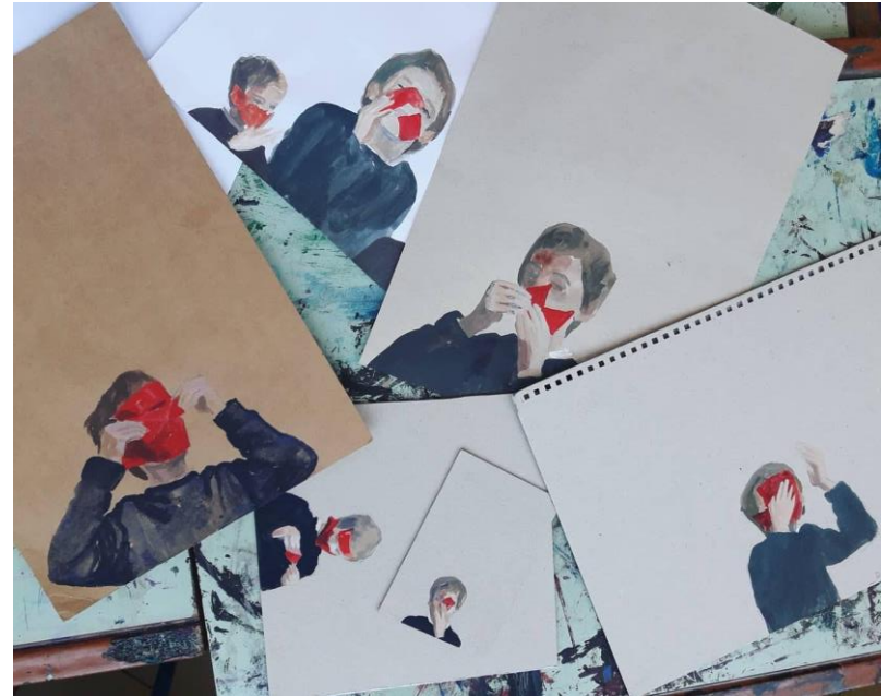
Sketches of "Roi somewhere home"