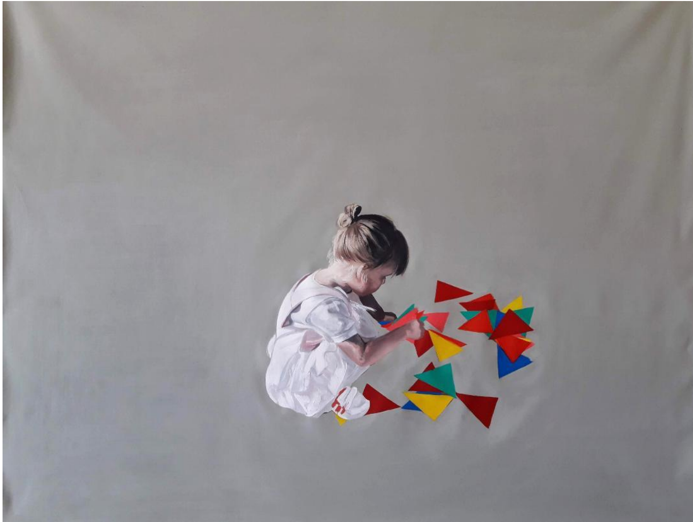
Amel somewhere home, 2019 Acrylic on canvas, 130 cm x 160 cm