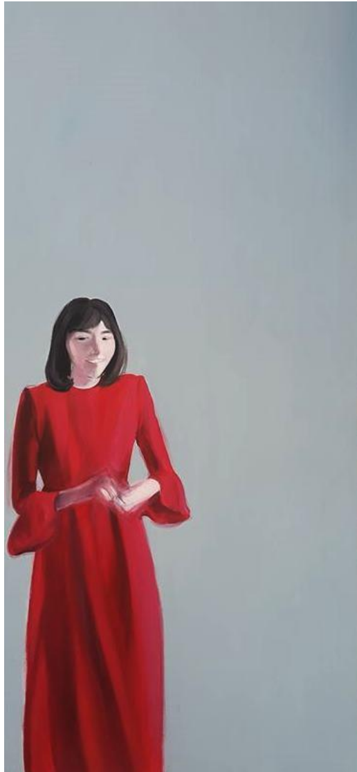
Celebration, 2017 Acrylic on Canvas, 95 cm x 190 cm