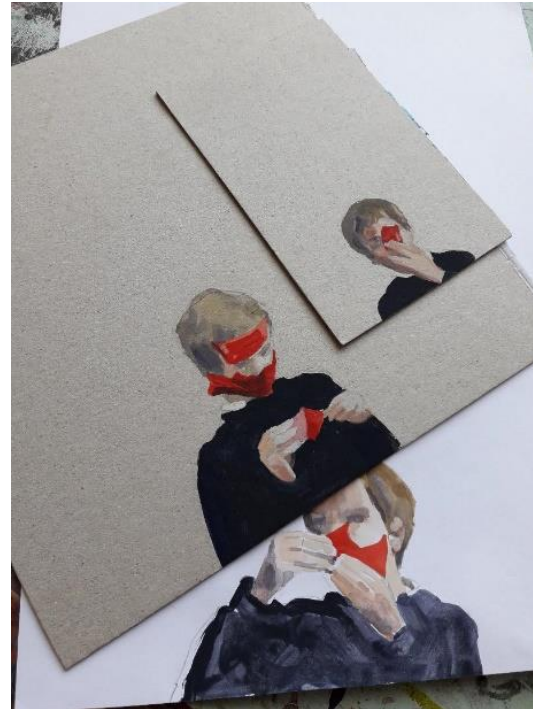
Sketches of "Roi somewhere home"