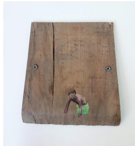
The summe , 2019 Acrylic on wood (chair) 32 cm x 36 cm