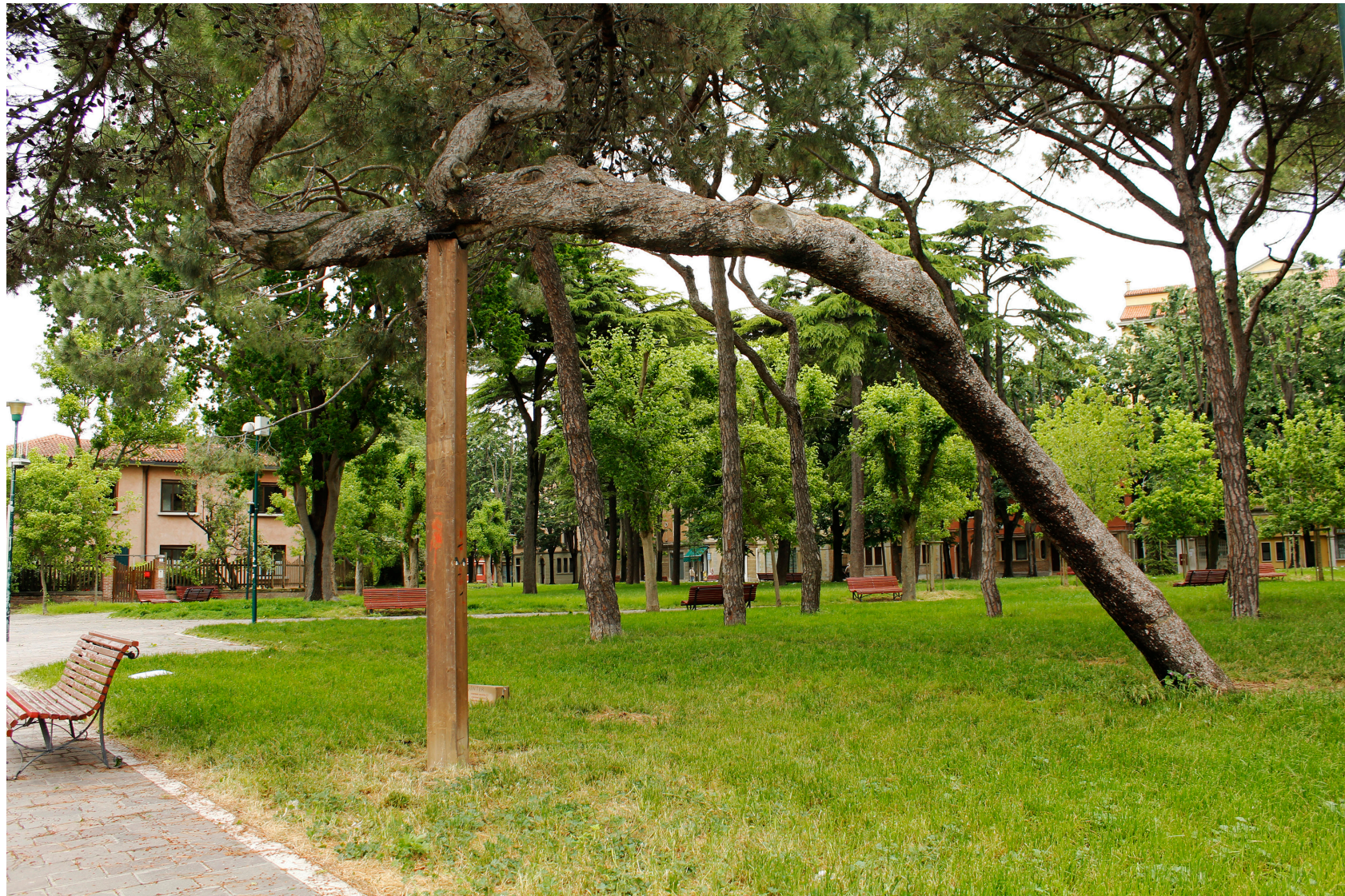
Untitled 2012, Photographic paper print, 75x55cm