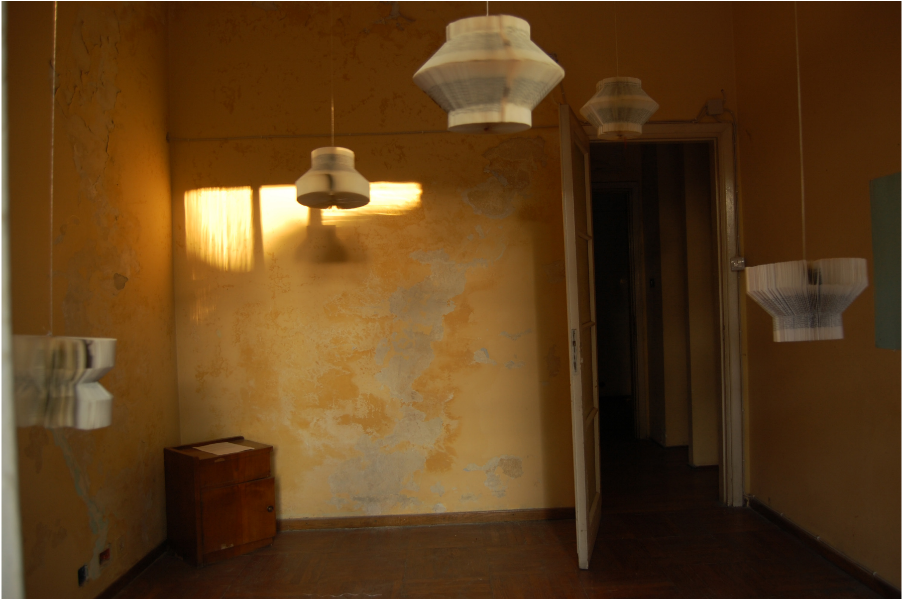
candy wrap collection ,2009 (installation view)