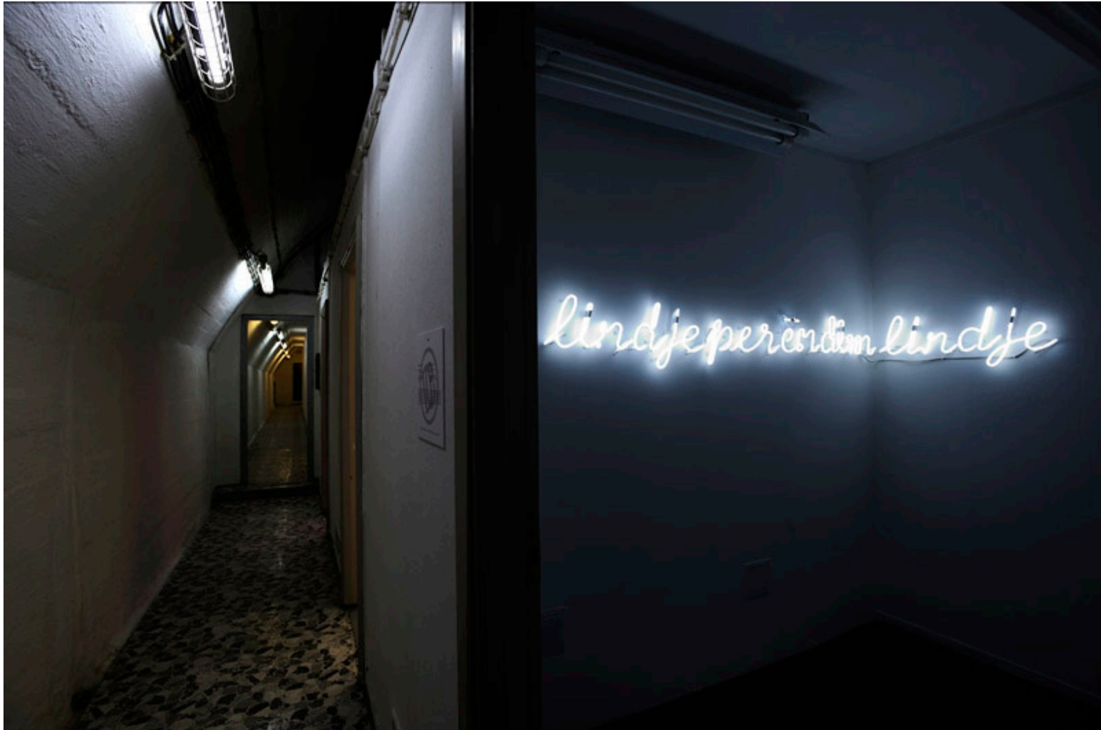
lindje perëndim lindje, (east west east), 2015, neon light writing installation, 12x280cm

The neon writing consists of three words in Albanian language. Lindje in Albanian language stands simultaneously for "East", "Sunrise" and "Birth". While Perëndim stands for "West", "Sunset" and "Decay".