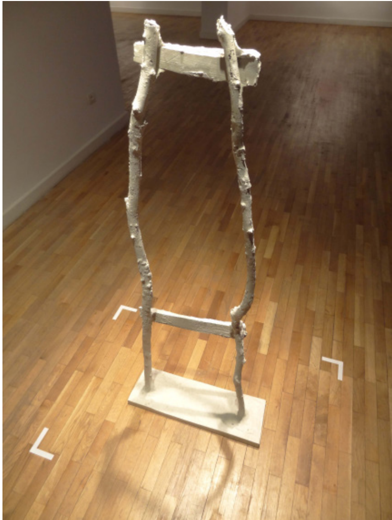
Rritesja 1,2012, installation,sculpture in plaster, 143x40x10 cm