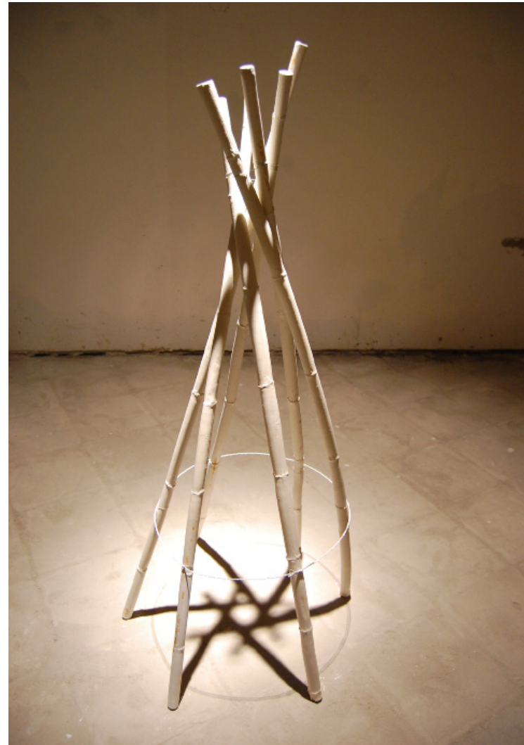
Rritesja 2,2014,installation, sculpture in plaster, 134x65x65cm

The structures fulfill a function only in relation with the tree, without the tree, these structures turn into “worthless bodies”. In my current work, they became part of my artistic investigation. In this way I try to give to these structures an aesthetic and communicative value, which was invisible before.