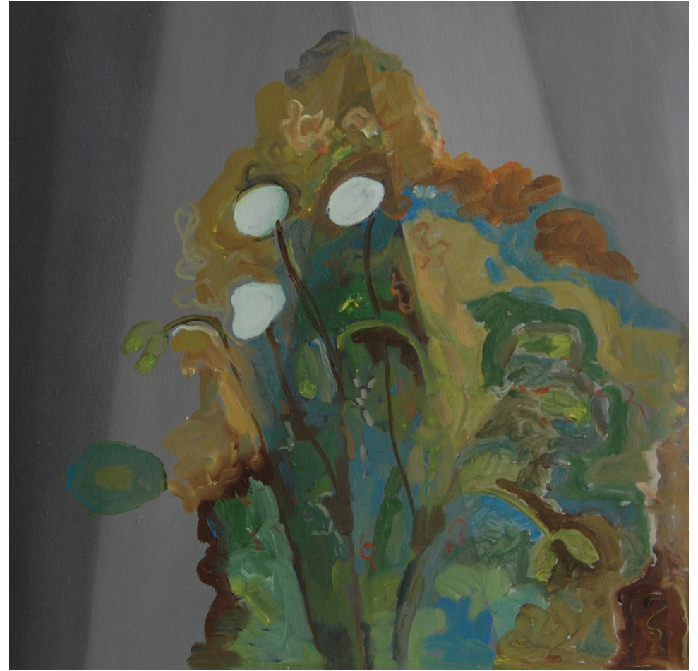
oil on canvas, 2017, 40x40cm