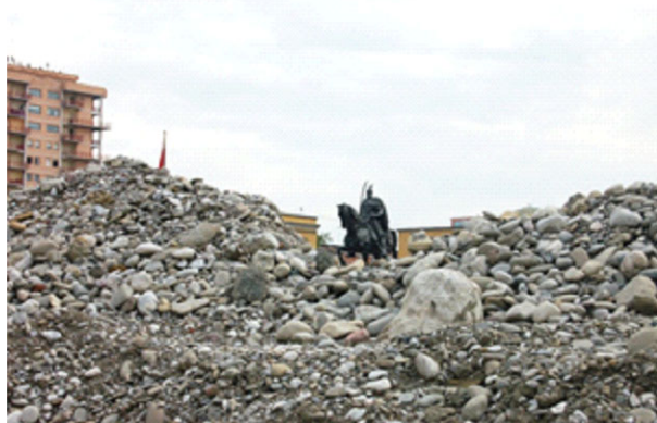
Frame video "Skanderbeg square Tirana Albania