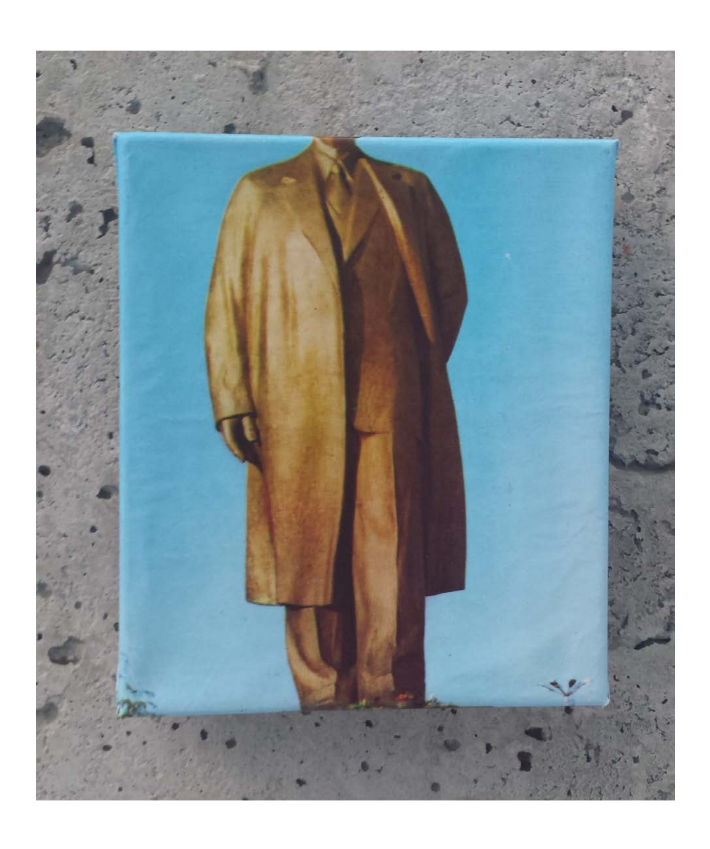
Man of gold 2015 Print on paper 10:12 cm