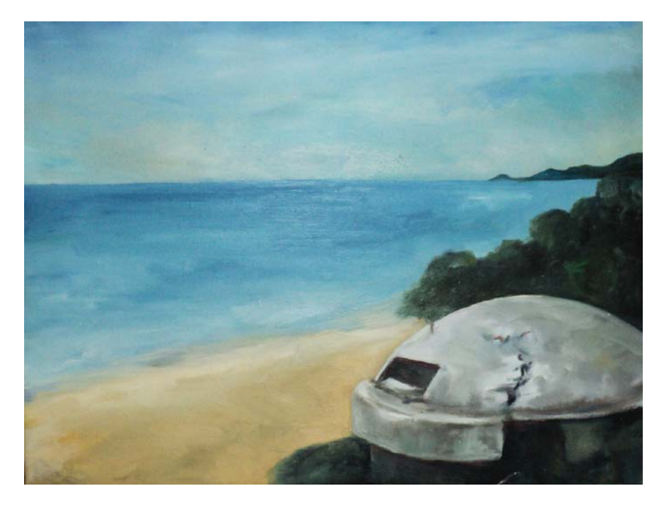
Durres hills (Oil on canvas 2010)