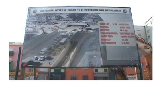
Frame video 6:55min square 'rilindja' Tirana Albania