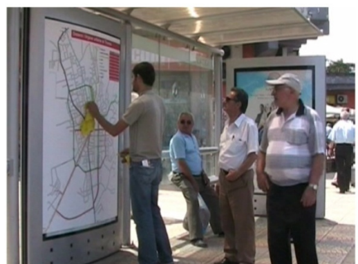
frame video Tirana Albania