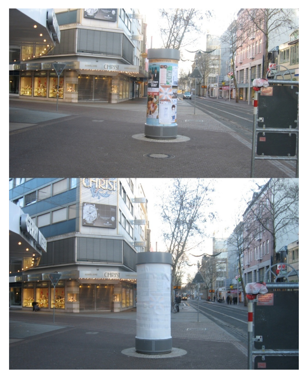
Frame video documentation Karlsruhe Germany 2007

This is image (video documentation of action 3:50 2007)