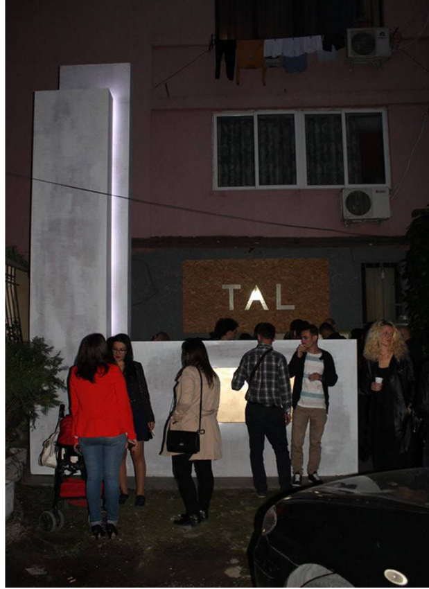
Instalation /450x:350x60 cm / Tirana Art Lab Tirana Albania

A monument, at the place where Stafa was killed was build and still exists today on a street named 5th of May, located next to the big market of the city of Tirana. The monument is surrounded by selling stands, appearing as an absurd construction in the middle of the trade center. Bujari is duplicating the original monument in original size and will install it in front of Tirana Art Lab, located in the very city center. In his new work "A Monument for a Monument", Bujari uses simple strategies of replication and relocation in order to change the context and at the same time the frame in which the monument is being taken in consideration, creating possibility for debate and re-evaluation.