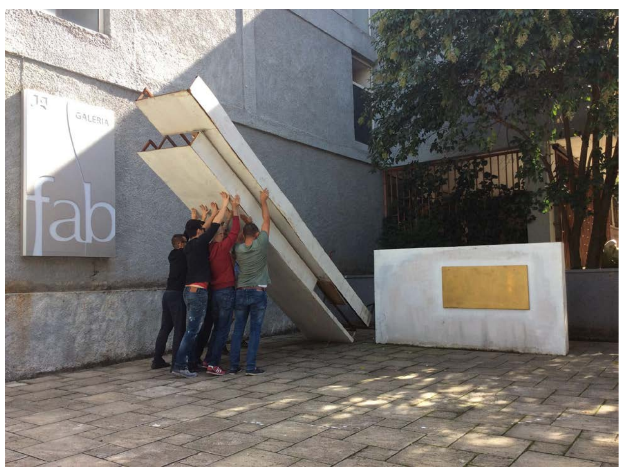
Instalation /450x:350x60 cm / Galery FapTirana Albania