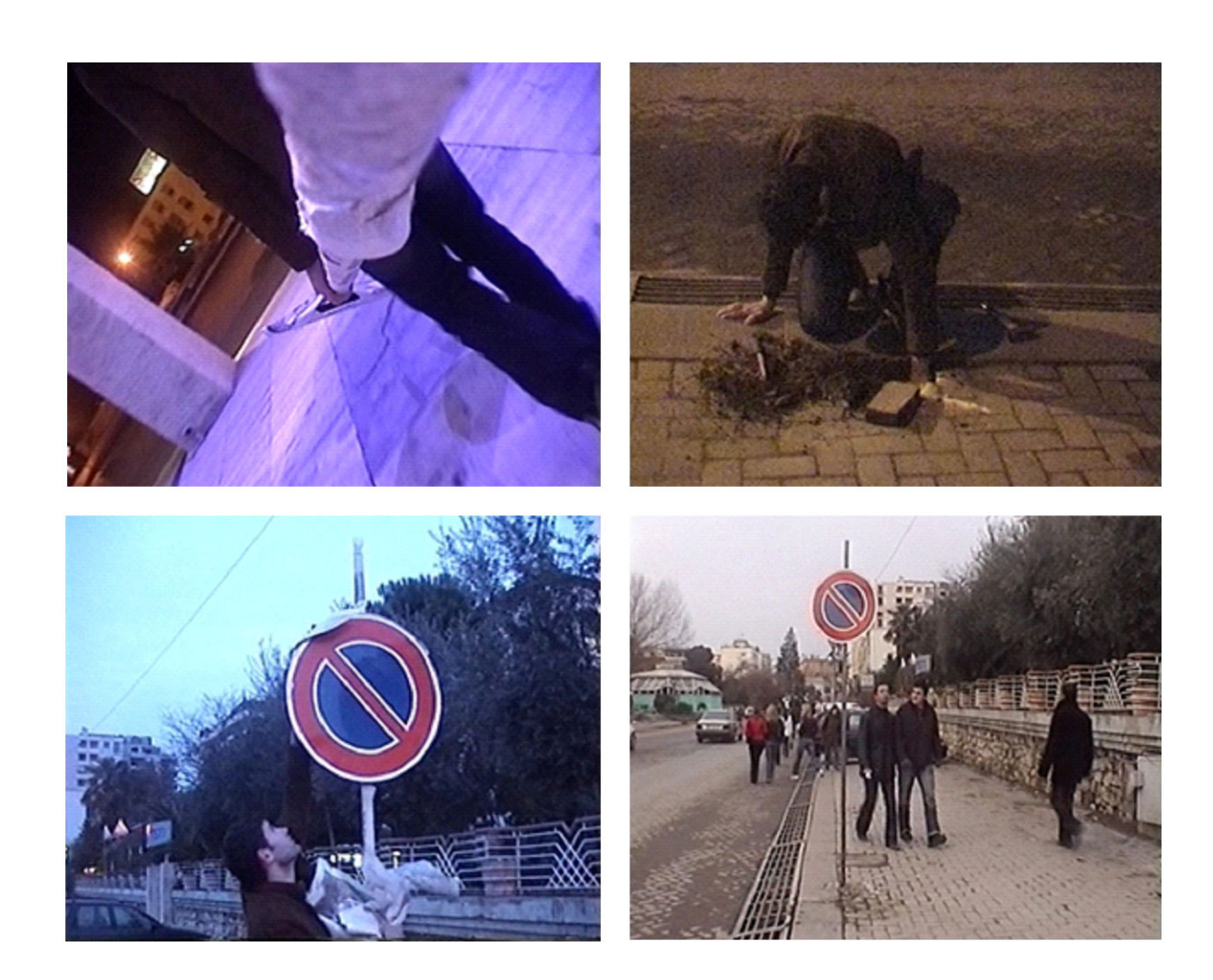
Frame video documentation of action, square Nene Teresa Tirana Albania