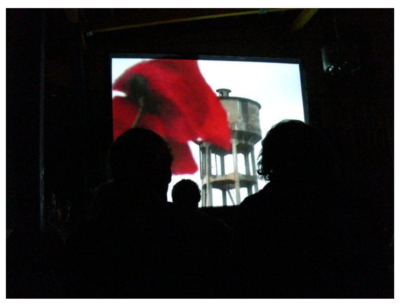
Frame video 3:30min