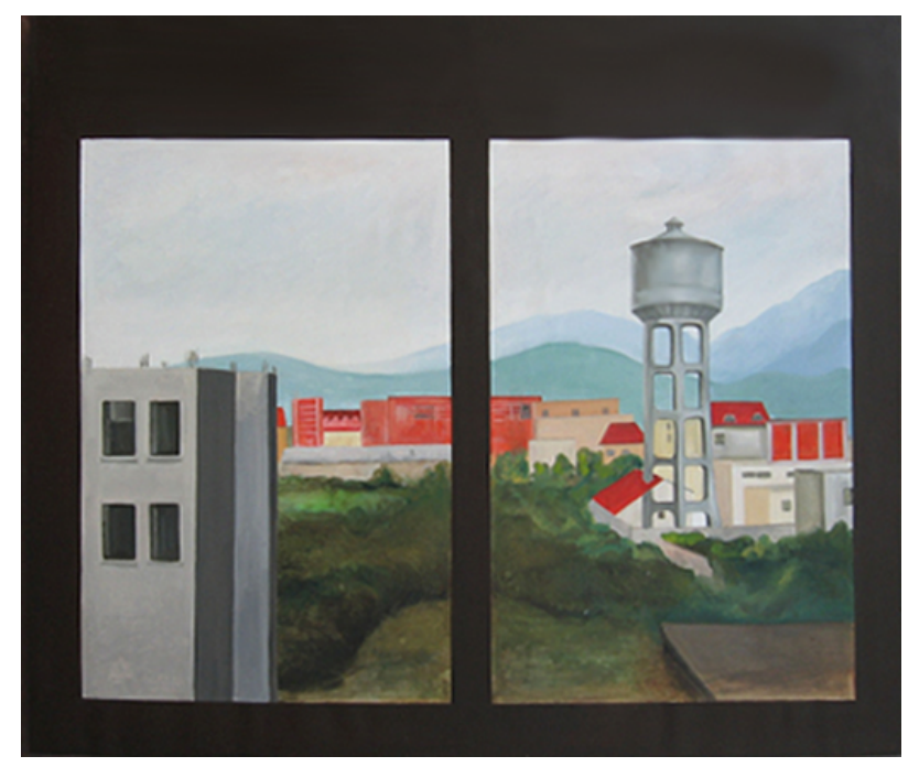
From Home (oil on canavas 2009)