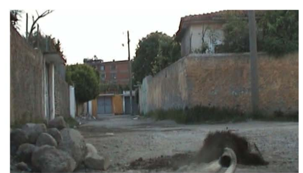
Frame video Shkodra Albania