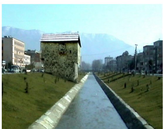
Frame video river lana Tirana Albania