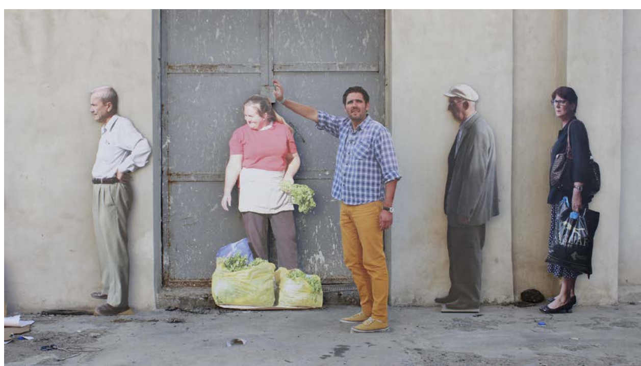
Mirage street 20015 instalation /180:50x7 cm , on street Tirana-Shkodra Albania