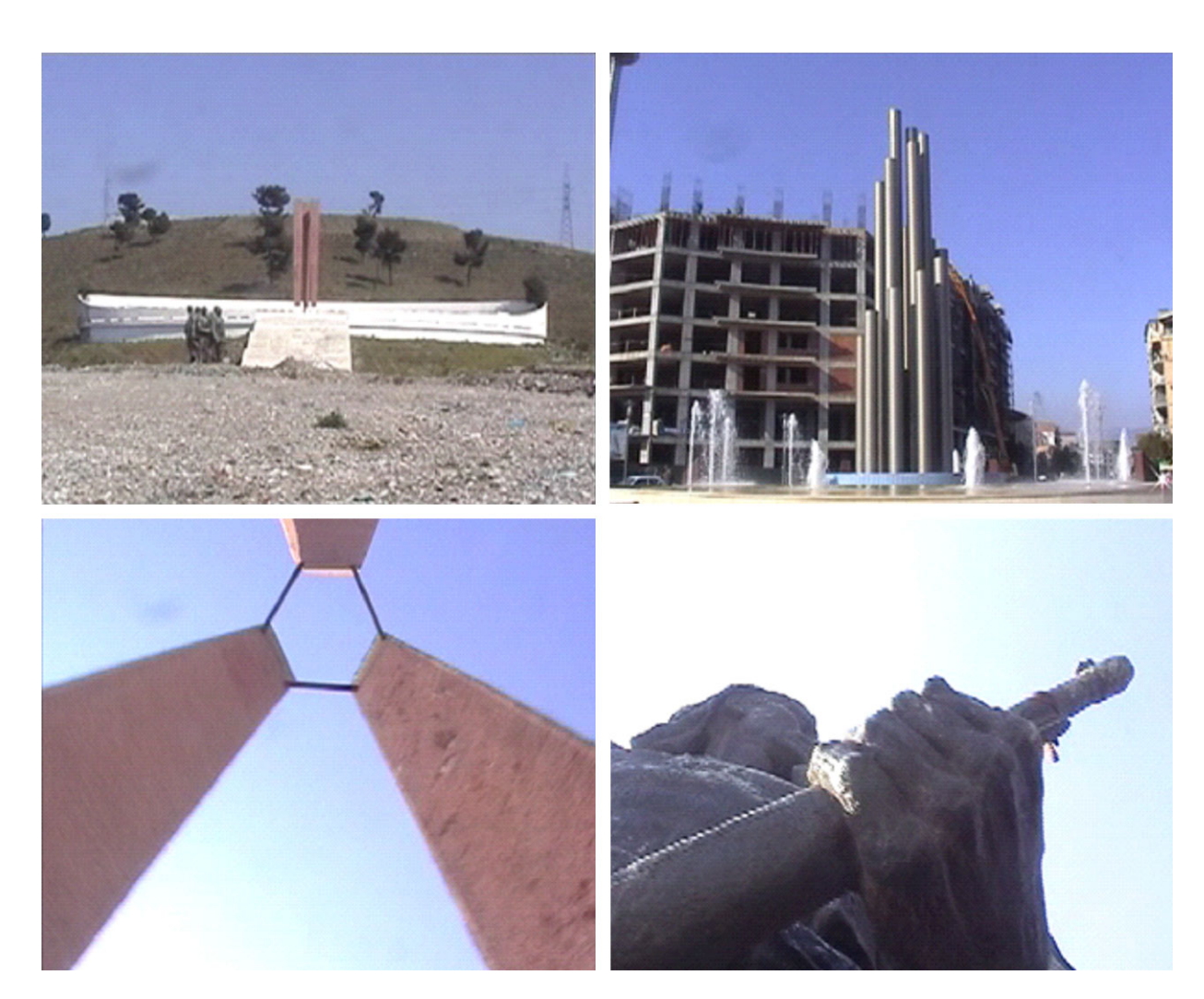
Frame video 3:35 min