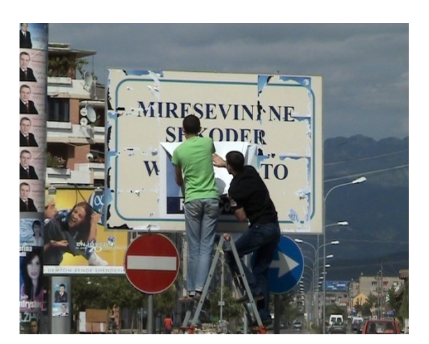
Frame video "Welcome to Shkodra" Shkodra Albania