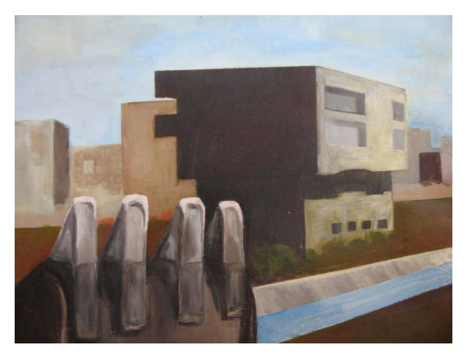
Lumi Lana (Oil on canvas 2010)